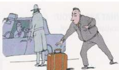
_____ my luggage.