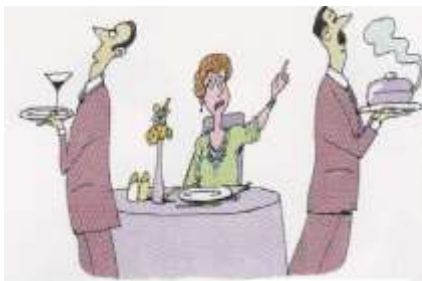
The waiters _____.