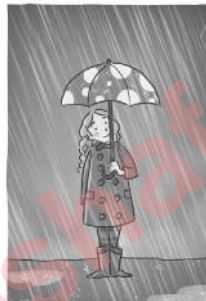
2. It's _____.