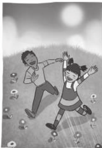
1. It's sunny .

2. Look at the pictures. Write the correct weather words from Exercise 1.